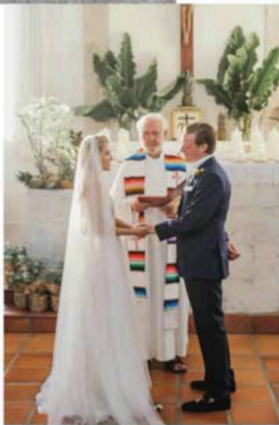
TOP TO BOTTOM The couple partied on the beach with family and friends; confetti flew as they left the church; making their vows